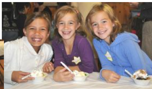
Sunday School Sundae Sept 2010